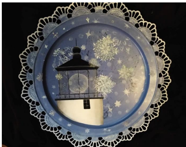
PAINTED BY HELEN