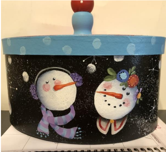
PAINTED BY GEORGIA