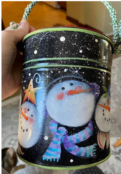
PAINTED BY RITA