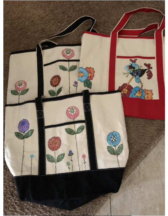
PAINTED BY GEORGIA