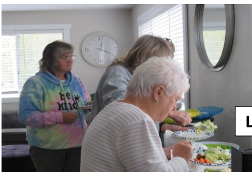
Lunch is ready!

MEETING MOMENTS: Enjoy these photos from the October paint-in.