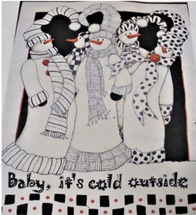
A Golda Rader design