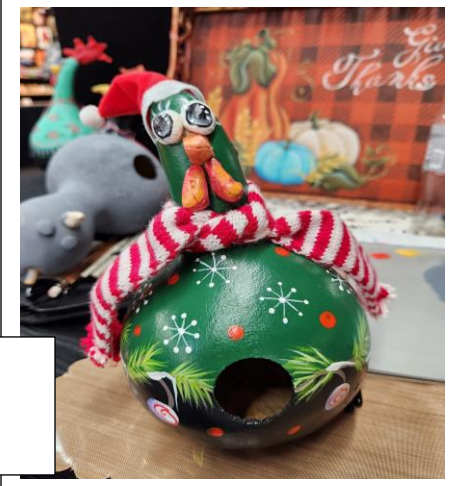
Barb Brad's tree (Left) and Pam Stalker's painted gourds; right and below