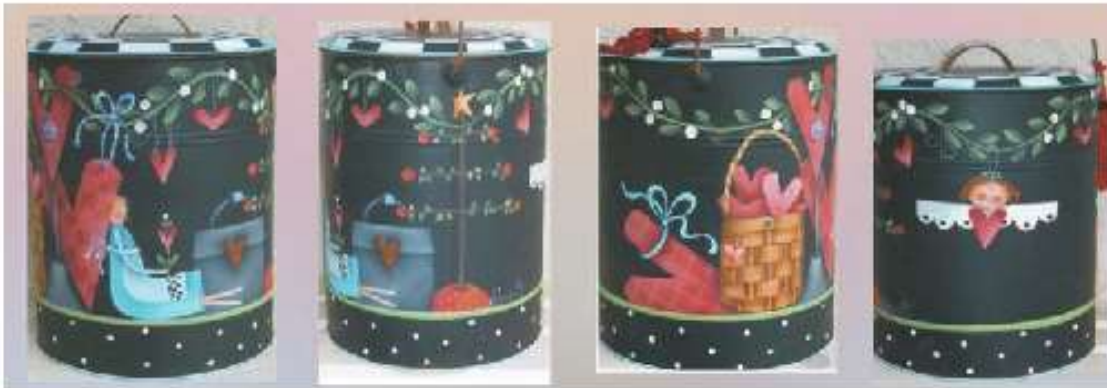
To Purchase this Bucket (#11228851) from Painters Paradise

----- PLEASE SIGN ME UP FOR SHARA REINER'S CLASS AUGUST 24 & 25!!